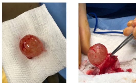
Figure 2. Photograph of a 3 cm recurrence of serous BOT resected after small laparotomy.